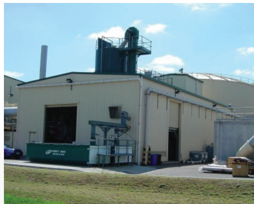
EarthPower Sydney Australia