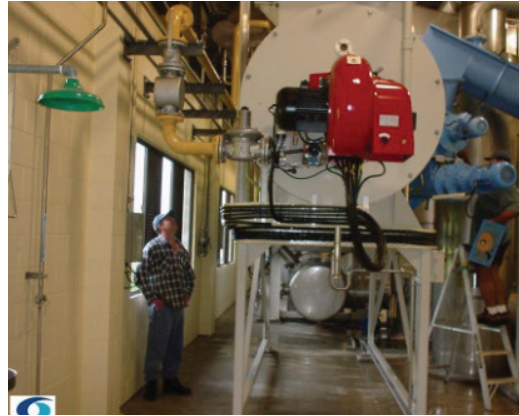
New Plymouth New Zealand 2000

Haarslev/Flo-Dry Rotary Direct Drying plants have operating histories of up to 12 years, on a range of sludge types and with a range of fuels including digester gas and direct use of engine exhaust heat, delivered as turnkey or equipment package only.