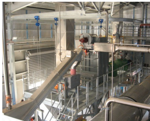
Hutt City New Zealand 2001