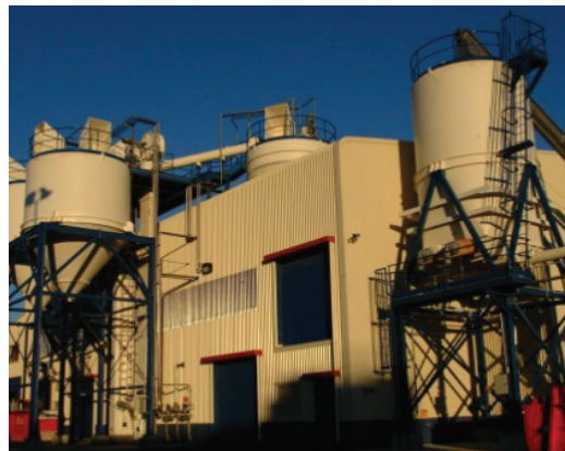
United Water Ballarat Australia