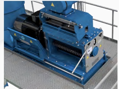
Hard-faced hammers with four wearable surfaces - all four edges can be used before a new set is required. The milling plant comes an insertable service tray to eliminate the risk of needlessly dropping hammers into the machine.